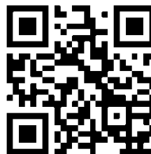
Whales Tales online