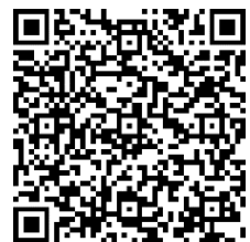
Relay Team Entry form