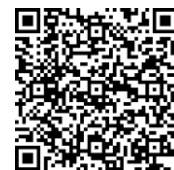
Relay Weekly Team form